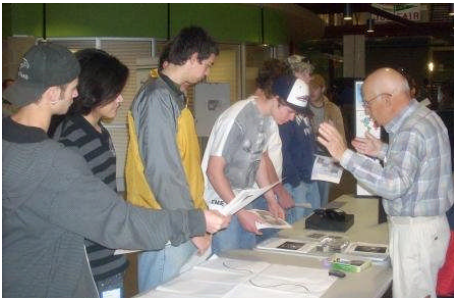
IEEE Exhibit – promotion of electronics and electrical engineering careers