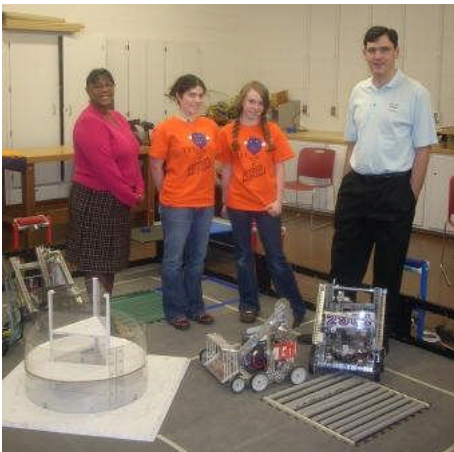
FIRST Robot Exhibit – Students operated robot while team members described their work.