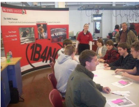
NCSU Lean Manufacturing Simulation – Students learned about Lean practices through hands-on activities